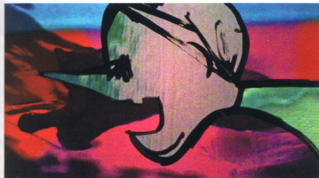
Ellen Berkenblit, Lines Roar , 2018, HD video, color, sound, 12 minutes 21 seconds.