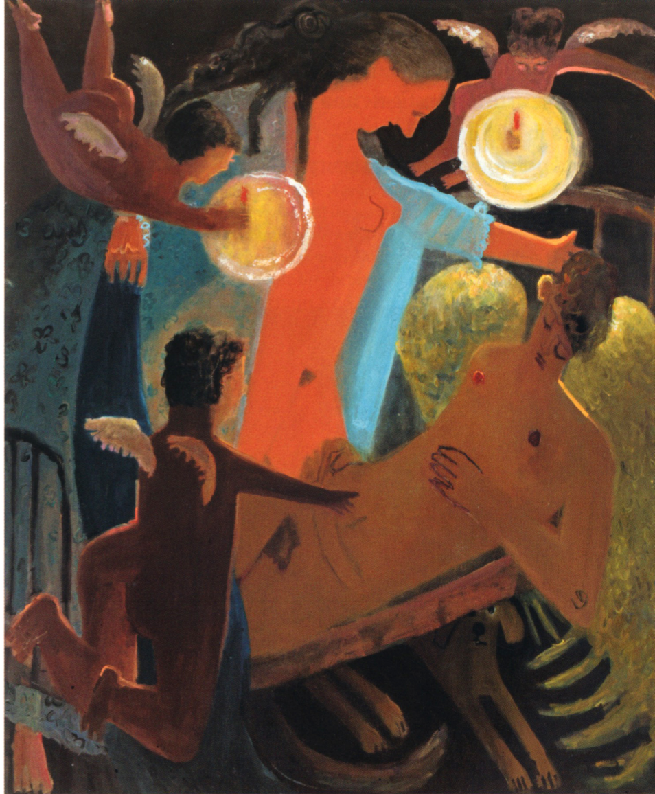
Kyle Staver, Psyche's Watch , 2018, oil on canvas, 68 × 58".