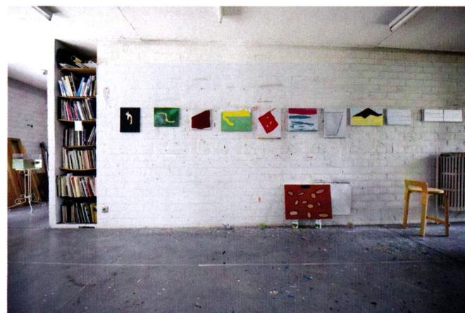
Raoul De Keyser's studio, Deinze, Belgium, 2009.