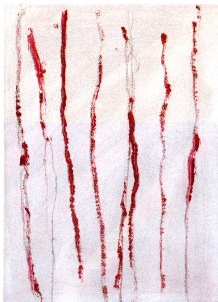
Left: Raoul De Keyser, No Title (8 Verticals/6) , 2010, oil on canvas mounted on wood, 11 x 8".