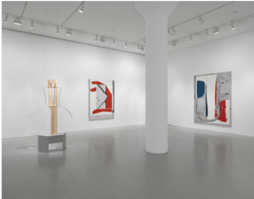
Installation view, "Jo Baer, Anne Neukamp, Diane Simpson," 2015, courtesy of Mitchell-Innes & Nash.

This three-woman exhibition consists of very different, though interestingly related, approaches to the use of recognizable subject matter. The subject matter is variously displaced, distorted or fragmented. As a consequence, the paintings and sculptures present combinations of recognizable parts that function abstractly, at once both generalizing, through reconfiguration, and particularizing, through new formal relationships absent in the original context. The new frameworks created represent likenesses, now estranged and somewhat alienated.