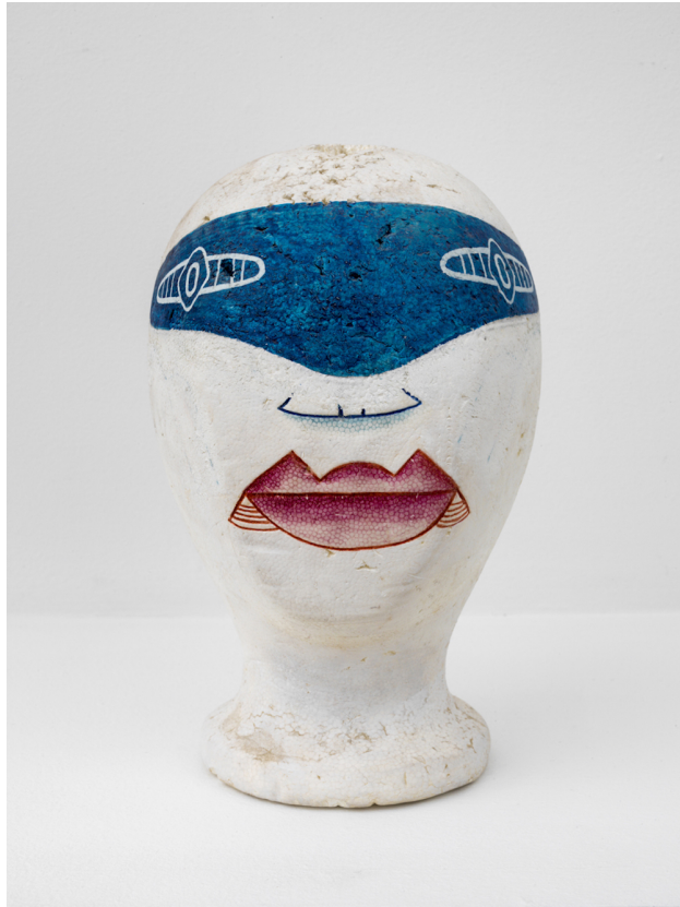
Karl Wirsum, “A Long Way from Foam #5” (c. 1976-1977), marker, acrylic, and ink on styrofoam, 10 x 5.75 x 6.75 inches (click to enlarge)

lived in. When we moved to California, I had a big studio space there, too — that’s where I did a lot of my puppetry. In general, those larger spaces offered me a chance to do different kinds of work, to follow Picasso’s example of approaching art from many different areas.