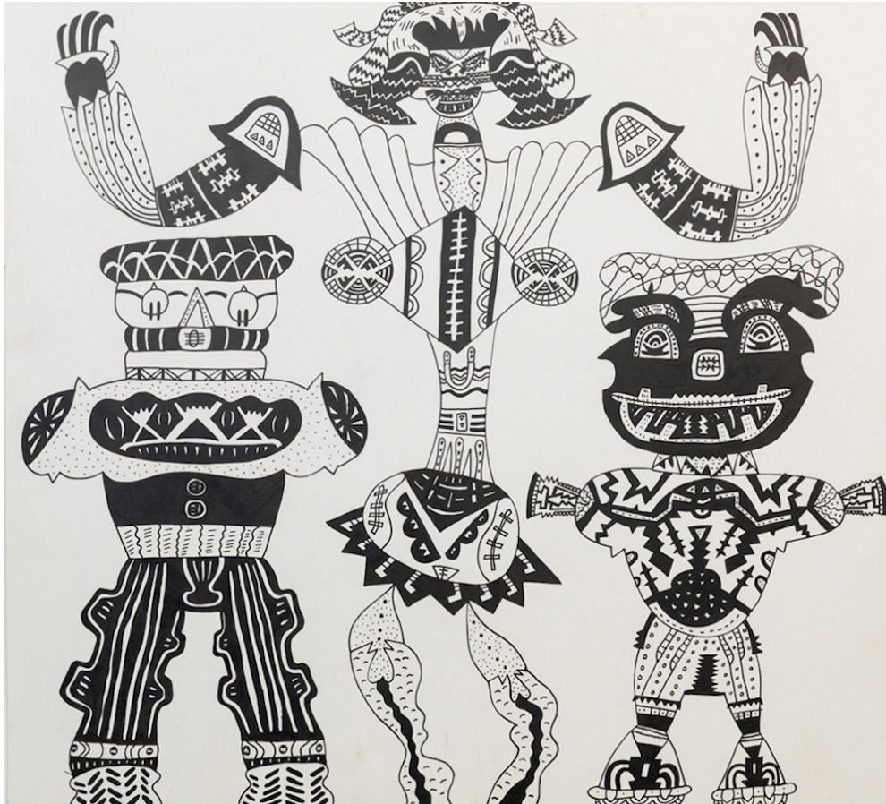
Karl Wirsum, "Untitled" (c. 1973), ink on board, 28 x 30.5 inches

NR: Do you think of building the figures in paintings up in the same way that you build the grommited figures?