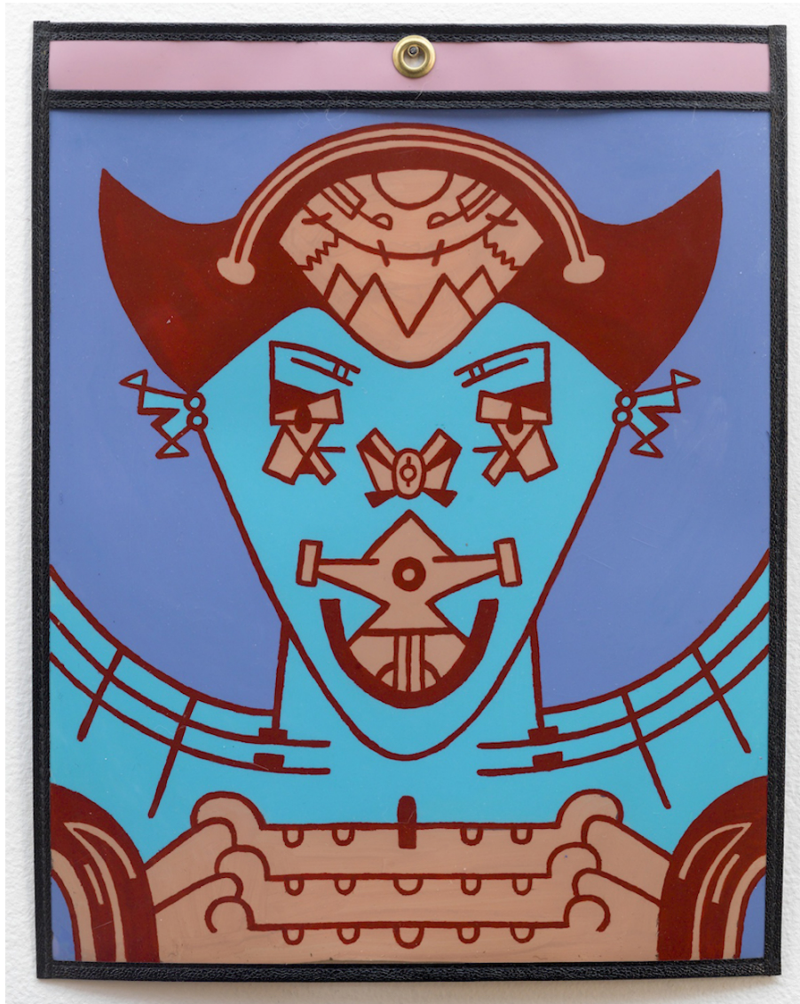
Karl Wirsum, "Alien Dating Service Portrait" (1977), acrylic on acetate, 12.25 x 9 inches

NR: Did Dubuffet's own art figure into what you were thinking about?