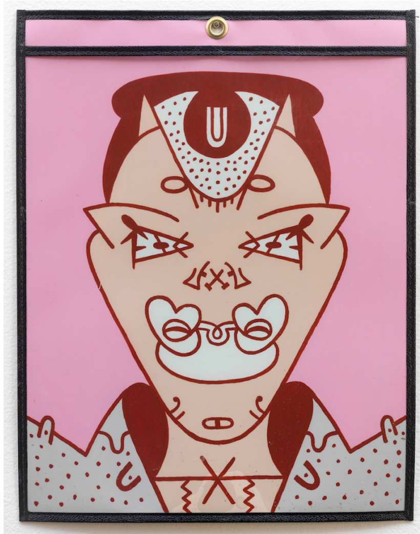
Karl Wirsum, "Alien Dating Service Portrait" (1977), acrylic on acetate, 12.25 x 9 inches

NR: What about the material for the "Alien Dating Service" portraits (1977)?