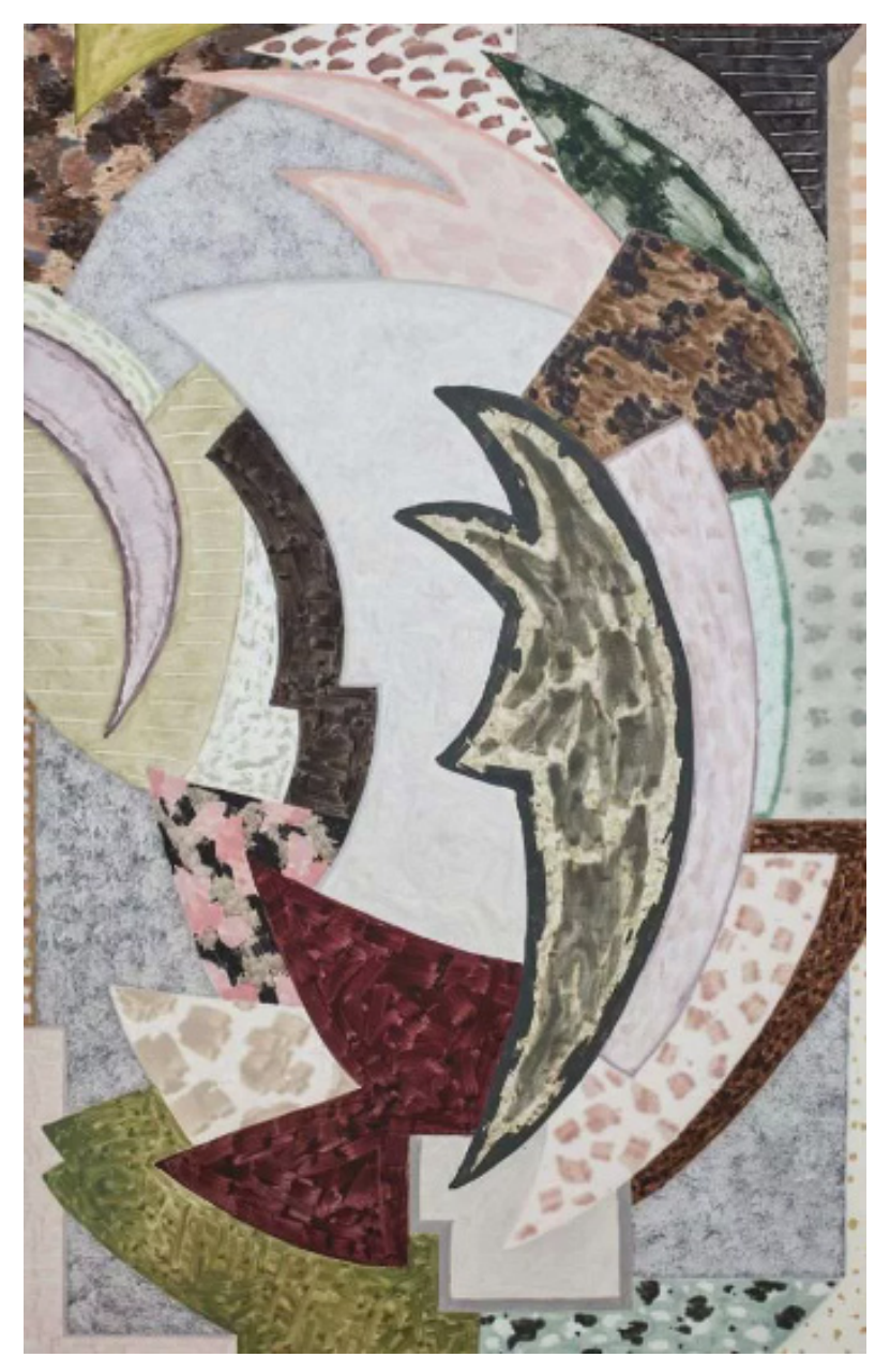
REBECCA MORRIS, UNTITLED (#06-16), 2018. OIL AND SPRAY PAINT ON CANVAS. 80 X 69 INCHES. COURTESY OF THE ARTIST AND CORBETT VS. DEMPSEY.

certainly affects Morris's decisions to utilize the more liquidous, porous, bleached gestures and bright color washes happening on many of the canvases."